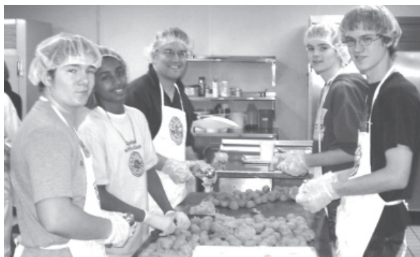
Confirmation students and Cookie Cart employees busy in the kitchen.