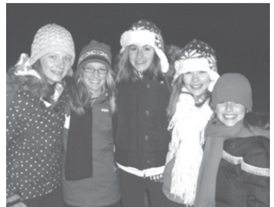
6th Grade Sleep-out Participants

Heading into this, I had no idea what to