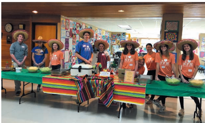
2017 High School NPH Mission Team

This summer during VBS at Holy Name of Jesus you can help support NPH by coming to lunch