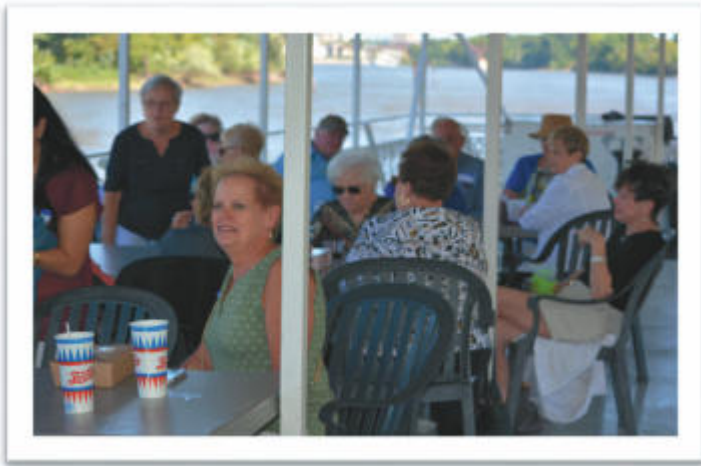
The Super Seniors and Soul Sisters Enjoying the Jonathan Padelford trip on a lovely fall day!