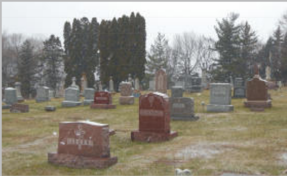
Holy Name Cemetery