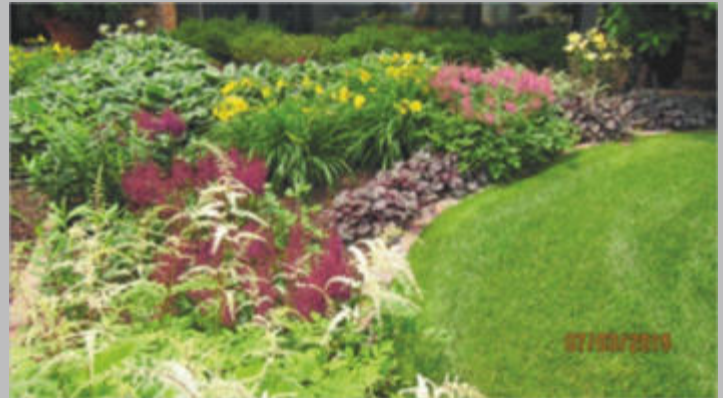
Holy Name of Jesus entrance garden

We'll be doing a fall clean-up of the cemetery in early November, so we ask that you remove any items of value by Oct. 31. Please do not plan to put any winter wreaths on graves until Nov. 15 so that we can complete the clean-up. We also encourage you to remove plant stands at this time. They become frozen in the ground and are at risk of being damaged if we need to dig a winter grave. Thank you for helping us to be good stewards in the care of the final resting place of our deceased loved ones.