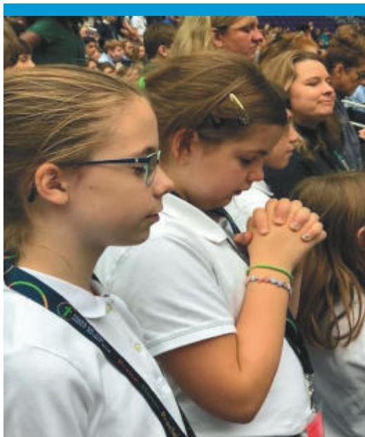
Mass of the Holy Spirit, US Bank Stadium