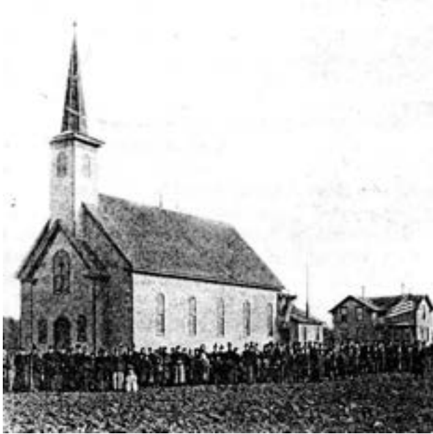
The 1874 church

The first log church was built near the shore of Holy Name Lake across what is now County Road 24 from the current site of the church. The first bell and chalice for the church were reportedly donated by George Reiser.