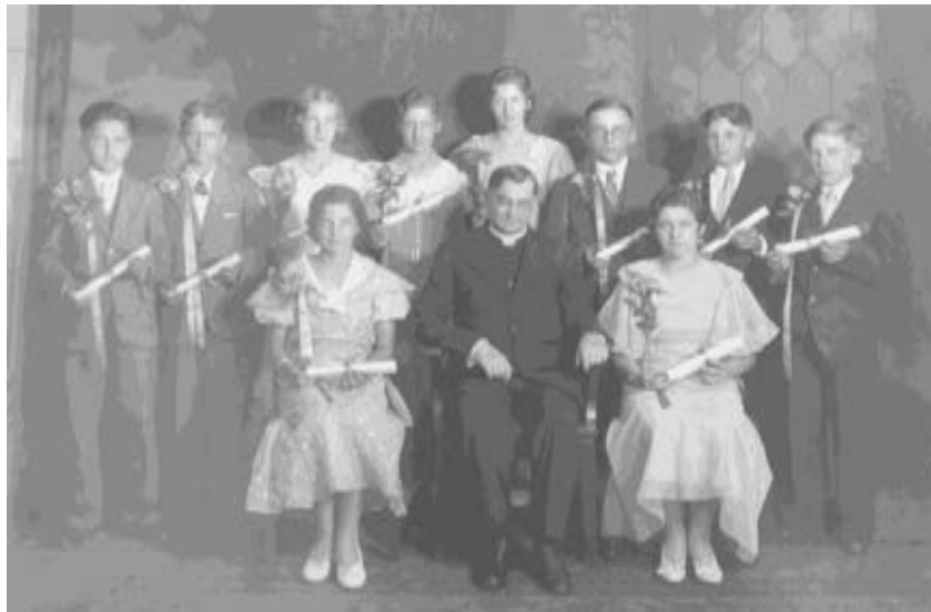
Holy Name School - Class of 1933