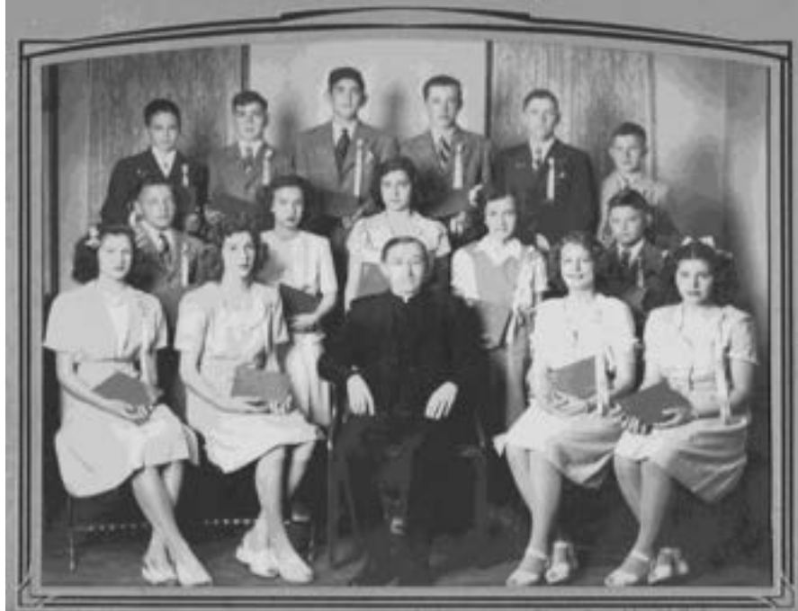
Holy Name School – Class of 1945