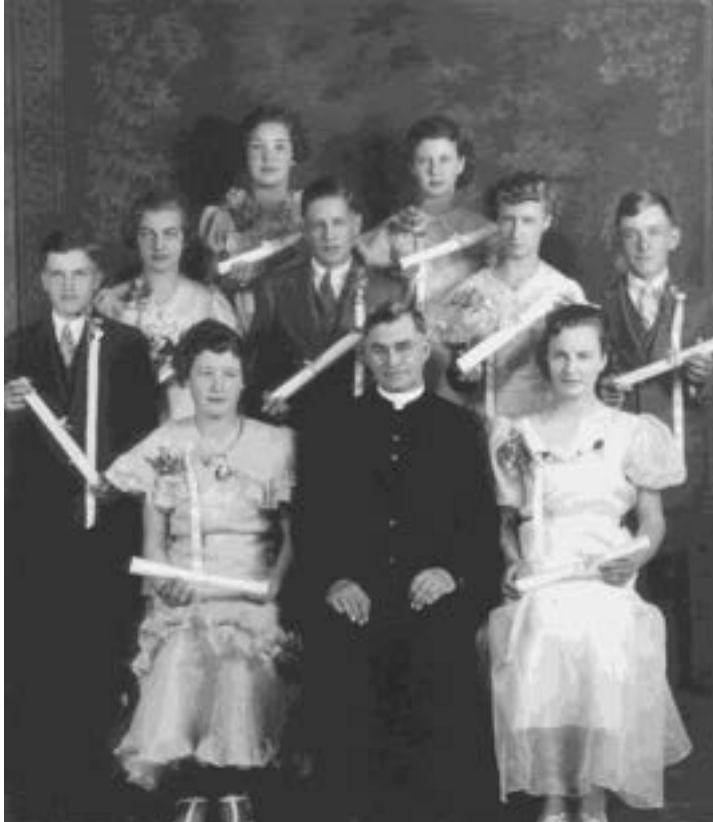
Holy Name School - Class of 1936