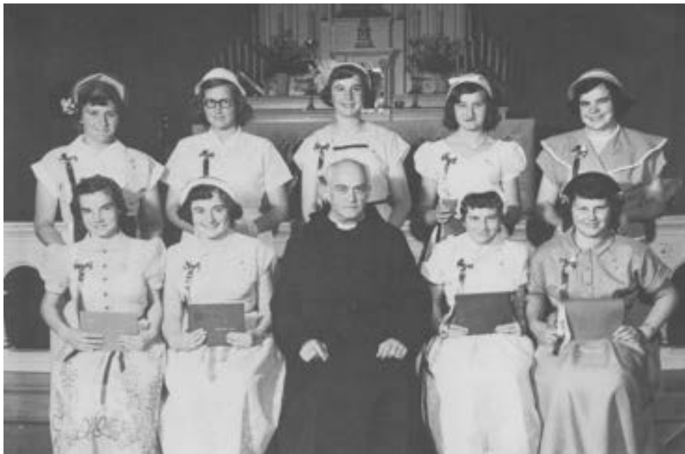
Holy Name Class of 1952