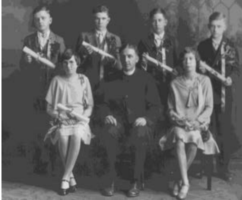
Holy Name School – Class of 1925

After the new school was built, there were cleaning committees appointed to maintain the building.