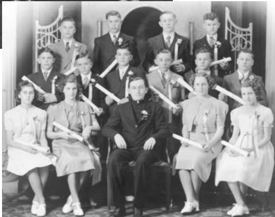
Holy Name School - Class of 1938