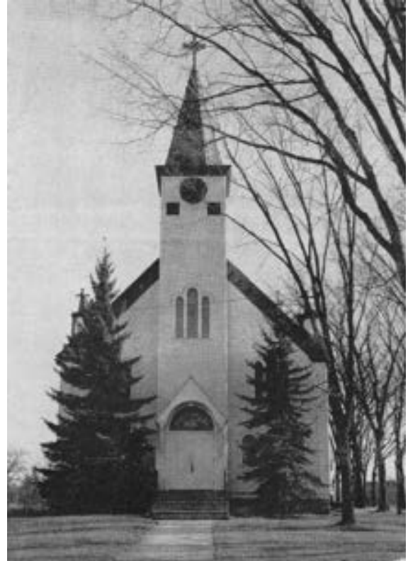
The 1911 church

The picture at upper is the oldest - note the wooded stairs and the ornate crosses on the steeple and the front corners of the roof. The picture above was taken later. The extra crosses have been removed from the steeple but remain on the roof.