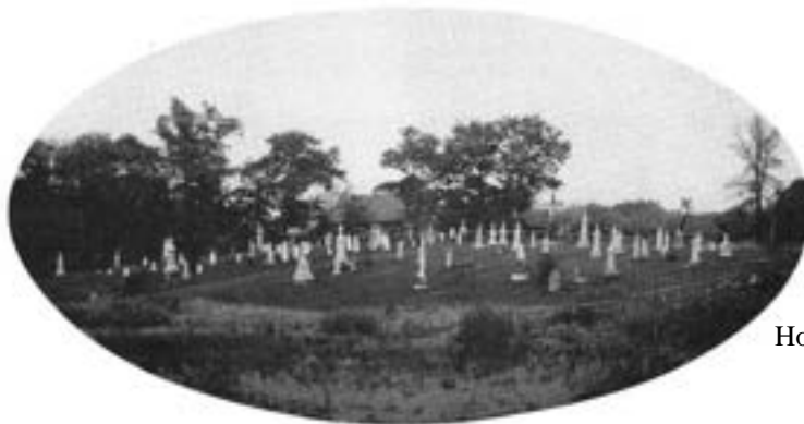
Holy Name Cemetery in the 1930s