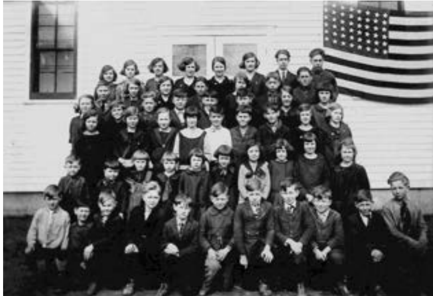
Students in front of Holy Name School about 1920

For most of the time from 1919 until 1955, grades one through four were in the “little room” and grades five through eight were in the “big” room. During the latter part of this period, grades seven and eight were taught in the church hall because there was not enough room in the school. The grades were arranged by rows. The teacher would instruction one grade while the others were expected to study. She rotated from row to row and grade to grade throughout the day.